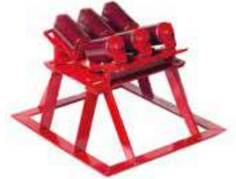
2115HD Launcher 7,500lbs capacity 24" pipe capacity