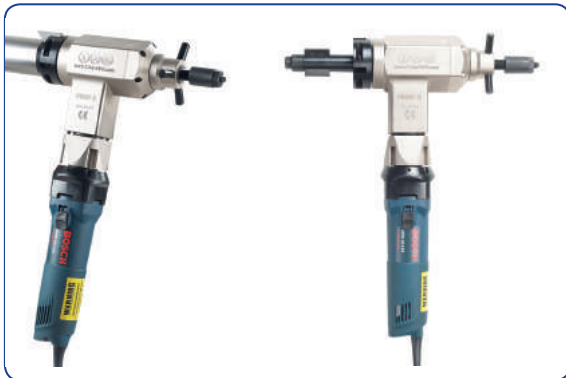
TAG Pipe Beveling Machine PREP 3

The PREP 2 Auto is a unique machine designed specifically for tube end facing, seal weld removal of tubes in heat exchangers and condensers and the "J-prepping" of the tube plate. The automatic locking, cutting and unlocking of this machine using the foot pedal supplied, dramatically reduces production time.