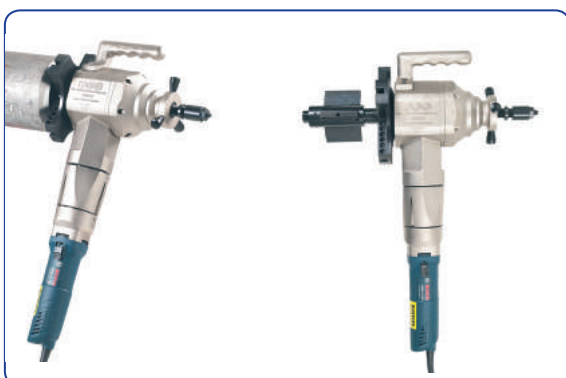
TAG Pipe Beveling Machine PREP 8

PREP 4 Heavy Duty available upon request