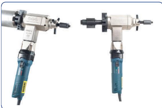
TAG Pipe Beveling Machine PREP 4

Simultaneous external and internal beveling and facing of tubes can be performed with ease for accurate repetitive work. Its size, power, and functionality, makes it extremely popular in high volume boiler repair and maintenance work, tube facing, weld removal, and J-prepping of the tube plate.